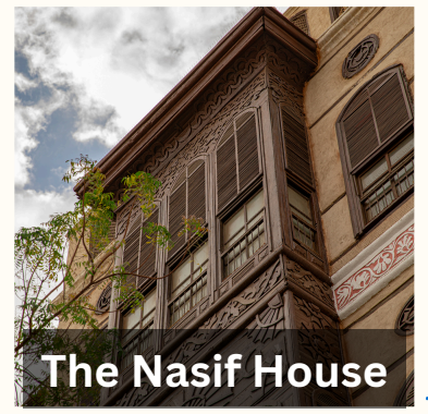
The Nasif House